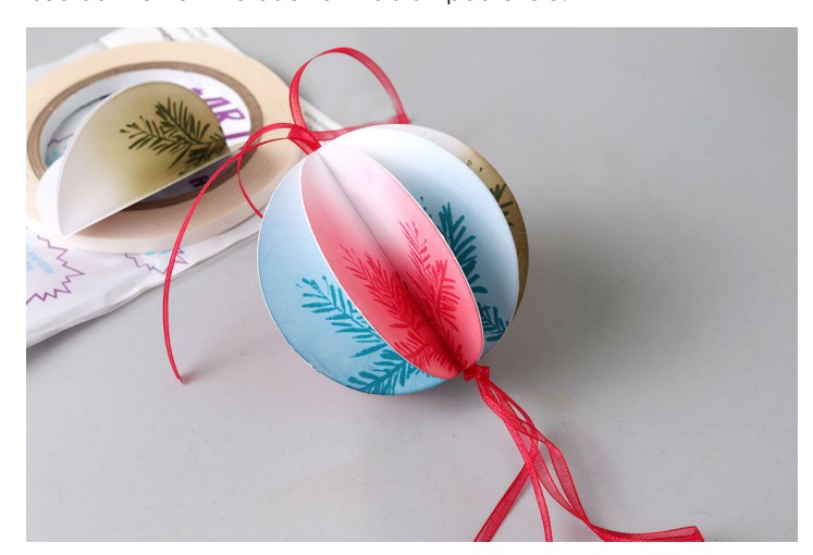
6. Before you adhere the last circles together to close the bauble, slip some ribbon inside and adhere using adhesive. Make a loop to hang at the top of your ribbon. Tie a knot at the bottom and top - you can add beads and other decorative elements as desired. And your baubles are ready to hang.