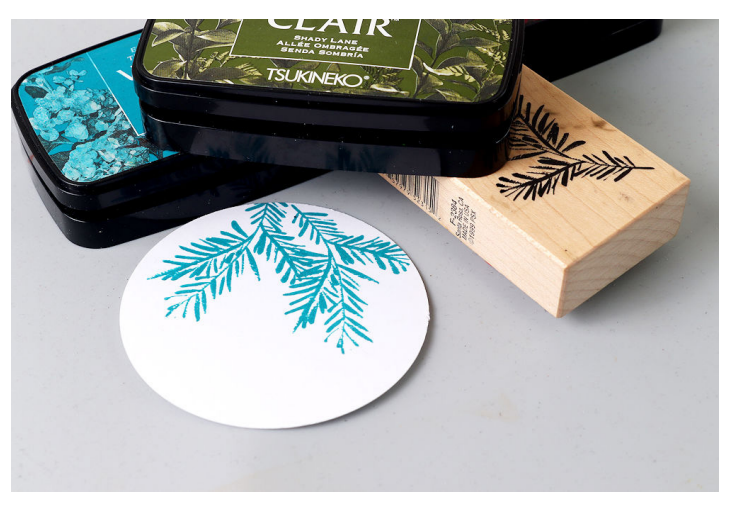
1. Punch 3" Circles out of smooth white cardstock. Stamp pine leaves onto each circle at the top alternating between your 3 colors of inks chosen.