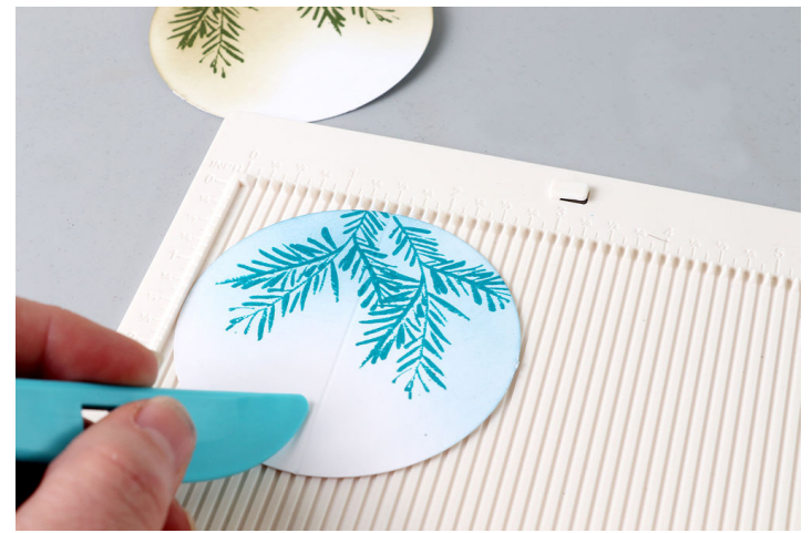
3. Use a bone folder and a scoring board if you have one to score the circles in half. You can also use a ruler.