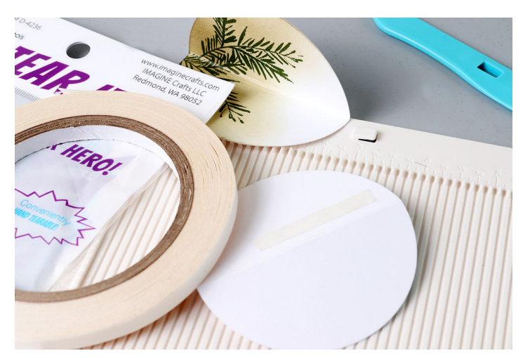
4. Add some Tear it tape to each half of the circle either side of the scored line - on the back of the stamped circle.