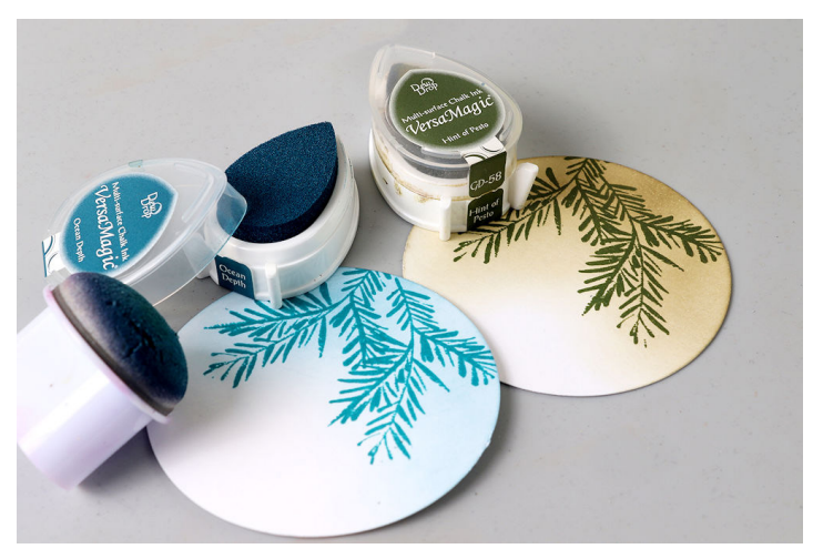
2. Match up your Versafine Clair ink that you stamped in with a Versamagic ink and blend some color over the background.