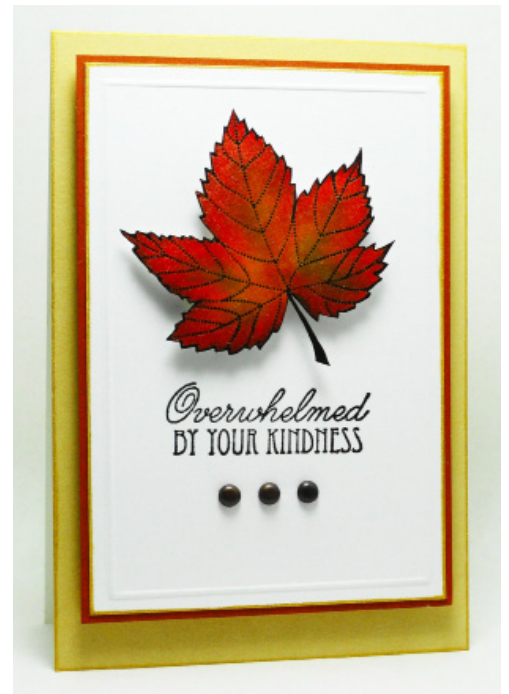
created by Elizabeth Allan

Other Supplies Antique Mini Brads by Making Memories, dimensional foam tape, double-sided tape, heat tool, scissors, scoring tool