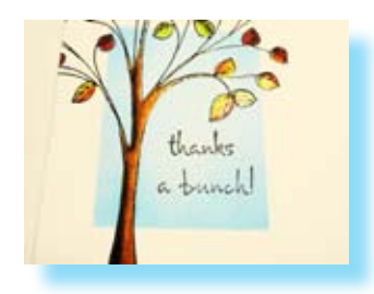
Step 5 Remove the Eclipse Tape and stamp the sentiment in Onyx Black VersaFine.

Step 2 Stamp Autumn Tree on white cardstock in Onyx Black VersaFine. While the ink is wet, sprinkle the image with clear embossing powder. Tap off the excess powder and heat set.